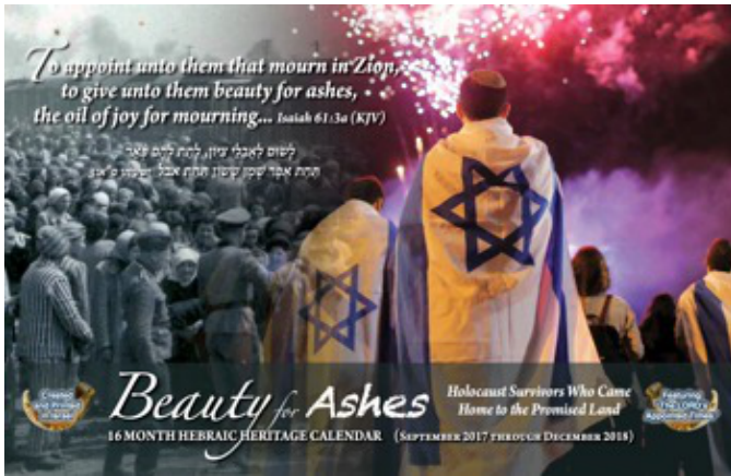
Sample of "Beauty for Ashes".

$22.95 inc GST. (Pick up only) (Pack & post $6.60 for 1 or 2 items)