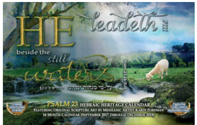
Sample of "The LORD is my Shepherd"

$22.95 inc GST. (Pick up only) (Pack & post $6.60 for 1 or 2 items)