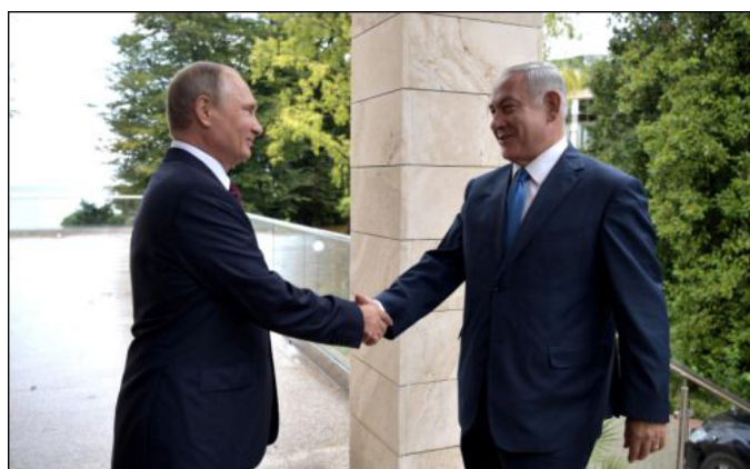
Russian President Vladimir Putin greeting Israeli Prime Minister Benjamin Netanyahu in Sochi on August 23, 2017.

But these meetings are by no means a Netanyahu monologue. The Russians also have their position regarding Syria and overall Iranian intentions, and – based on a number of conversations with senior Russian diplomats – it goes like this: Russia has genuine interest in Syria. Raqqa, the one-time Islamic State stronghold in northern Syria, is only 1,000 kilometers, or 620 miles, from Grozny, Chechnya, in southern Russia, the distance from New York to Knoxville, Tennessee.