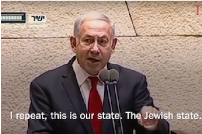
Prime Minister Netanyahu speaking at the Knesset before the vote on the Nation-State Law (Photo: screenshot)