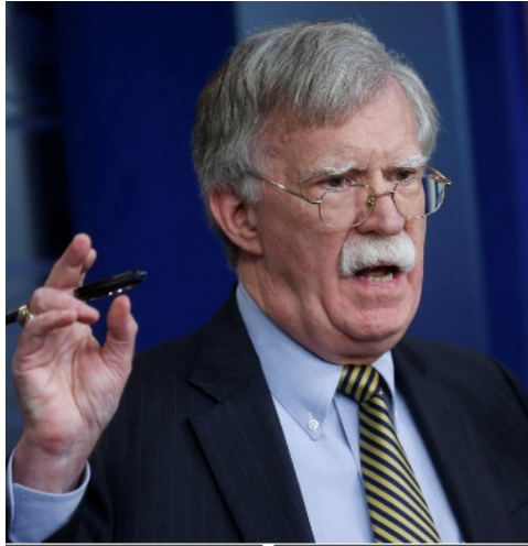
U.S. National Security Advisor John Bolton answers a question from a reporter about how he refers to Palestine during a news conference in the White House briefing room in Washington, U.S., October 3, 2018.

sanctions imposed since May by the Trump administration violated the terms their 1955 Treaty of Amity. Washington responded by pulling out of the treaty, a little-known agreement that was signed long before Iran's 1979 Islamic Revolution that turned the two countries into arch enemies.