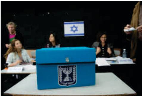
Illustration of a ballot box at a polling station in Tel Aviv.

Israel is set to have elections on April 9. This is right around the corner, and so we thought to address a few things that can change in Israeli immigration policy as governmental leadership changes. Israeli immigration issues fall under the purview of the Ministry of Interior (Misrad Hapnim) thus the identity of the Minister and the supervising clerks who the Minister appoints is quite important.