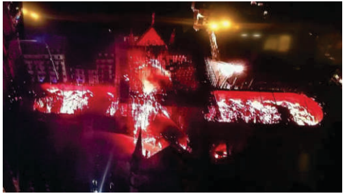
Extraterrestrial View of the Satanic Sacrifice Site

I was devastated by the total burning of Notre Dame cathedral, a place where I once prayed in thanks for one of my son's who survived what might otherwise have been a certain death. The parallels to both the Reichstag Fire and 9/11 loomed. Then I heard from the shadow foreign minister of France and I believe all of the following to be true and an indictment of Macron, Merkel, May, and the Pope — Notre Dame would not have burned as it did without the explicit complicity of the Church — and key police, fire, and government offices in Paris — in detail, in advance, and into the future.