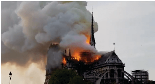
Notre Dame burning early on, fire brigades evidently held back

• 11 Afternote D: The roof of Notre Dame was original to the 13th century and has survived all wars, all manner of natural hazards. This was the single most precious asset in France, not so much a Catholic religious asset as a national spiritual cultural asset. Final conclusion: the Satanists are DESPERATE.