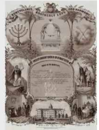
*“The Order of B'nai B'rith,” Jewish Times, February 15, 1879