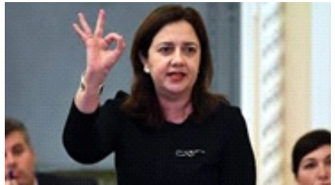
Queensland ALP Premier Anastacia Palaszczuk

The so-called National Cabinet comprising all of the State's Premiers and the Prime Minister will keep planning unnecessary Covid lockups until there is no more small business left in the state and nation.