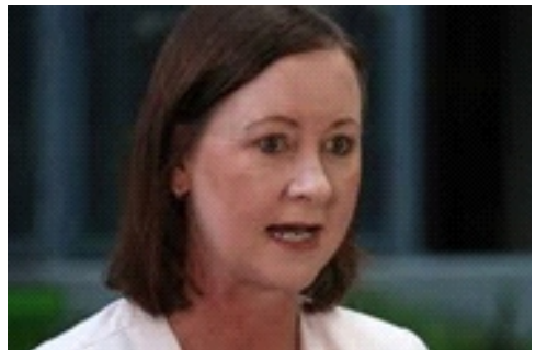
Queensland ALP Health Minister Yvette D'ath

These politicians have conspired to create a Queensland Covid