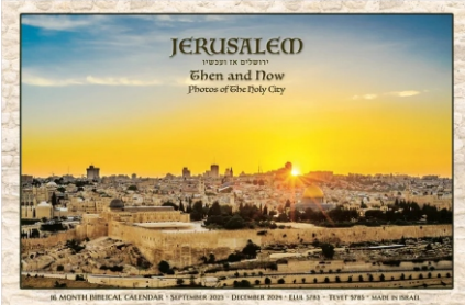
Calendar: "Jerusalem, then & now"

Day 2 of the 6th Biblical Month; Day 2 of Elul, the 11th month of 5783 ( Talmudic ) - August 19th 2023 ( Gregorian )