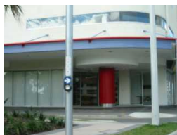
SURFCiTY Centre seen from Remembrance Drive looking South-east and when turning into Clifford St. Free basement car parking via Appel St.