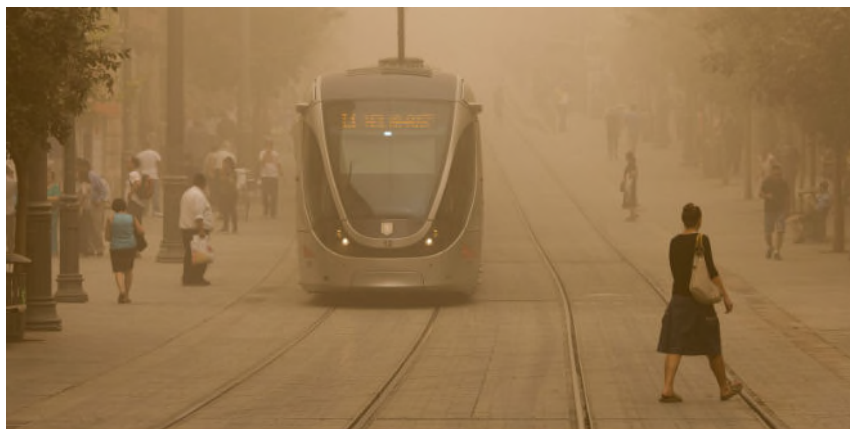
Israelis walk across the light-rail tracks on Jaffa road in Jerusalem on September 8, 2015, as a sand storm hit across Israel.

Visibility across Israel is low, with some domestic airlines canceling flights for the second day. Israeli airlines Arkia and IsraAir postponed domestic flights to Eilat on Wednesday, offering passengers transportation via buses.