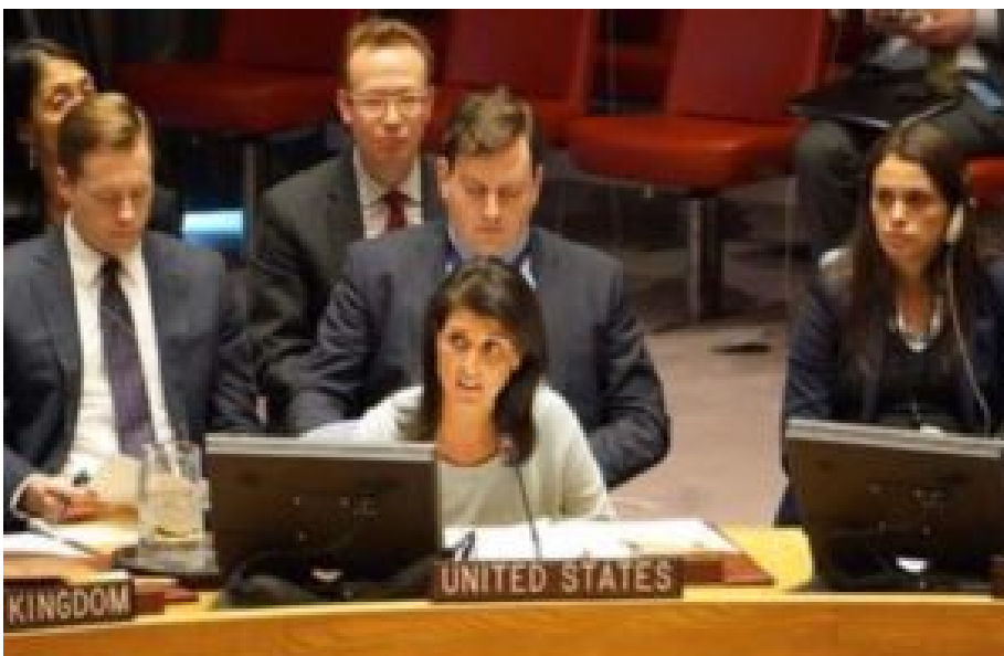
U.S. Ambassador to the United Nations, Nikki Haley