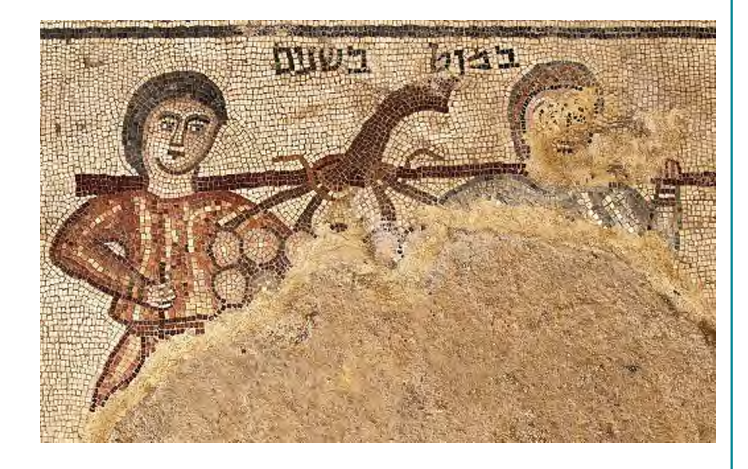
Two spies carrying a pole with a cluster of grapes. (Jim Haberman)

A recently unearthed mosaic shows two men carrying between them a pole on their shoulders from which is hung a massive cluster of grapes (the same as the easily recognizable symbol of Israel's Ministry of Tourism). With a clear Hebrew inscription stating, "a pole between two," it illustrates Numbers 13:23, in which Moses sends two scouts to explore Canaan.