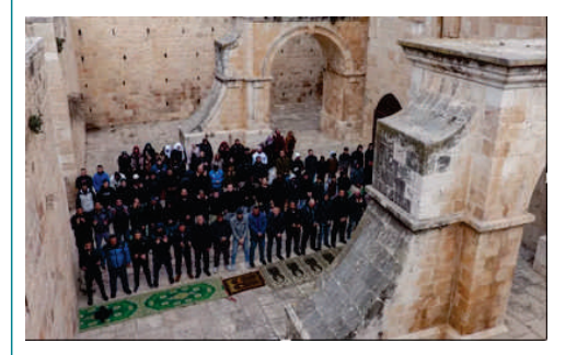
Muslim prayers outside of the Gate of Mercy.

The announcement said Israel had so far arrested 14 Waqf security guards who were involved in opening the Gate of Mercy and barred them from the Mount for different periods of time. The announcement also calls on Muslims to demonstrate on the Mount.