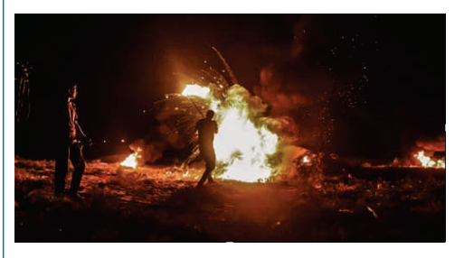
"Night Confusion" protesters on the Israeli border, March 2, 2019

Israeli communities along the border have resumed as well.