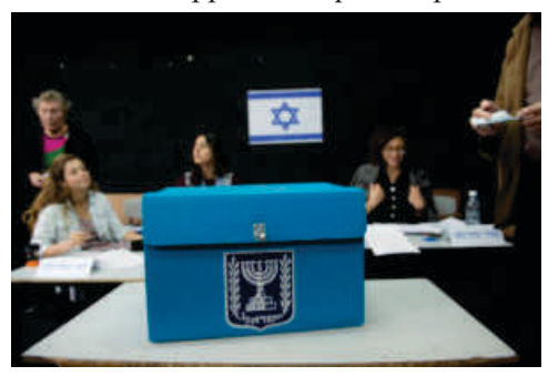
Illustration of a ballot box at a polling station in Tel Aviv.

Israel is set to have elections on April 9. This is right around the corner, and so we thought to address a few things that can change in Israeli immigration policy as governmental leadership changes. Israeli immigration issues fall under the purview of the Ministry of Interior (Misrad Hapnim) thus the identity of the Minister and the supervising clerks who the Minister appoints is quite important.