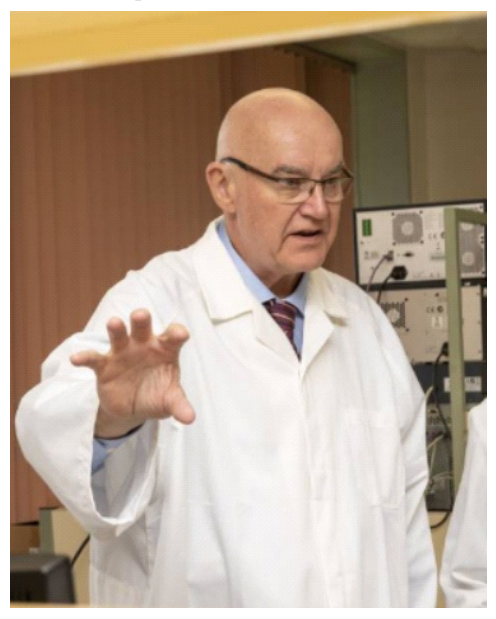
Corporate health bureaucrat Skerrit bestows his most holy blessing upon a vaccine lab early in the plandemic.

When asked by his ABC interviewer about the number of deadly adverse events in Australia, the doctor claimed there had "only been about 10 deaths from vaccines", and specifically the ones that caused blood clots. No doc, the official statistics from the TGA in May 2020 were 210 post-vaccination deaths.